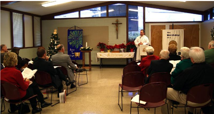
Christmas 2011 at Eternal Life Lutheran Church